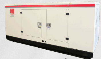
Saccal Enclosure / Canopy