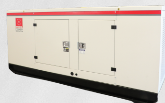
Saccal Enclosure / Canopy