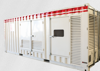
Saccal Enclosure / Canopy